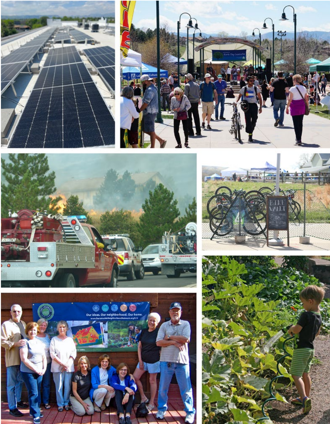
A photo collage showing various examples of the Sustainability and Climate Action guiding principle in action across the city through community events like Earth Day, emergency response and preparedness, and sustainable transportation options.