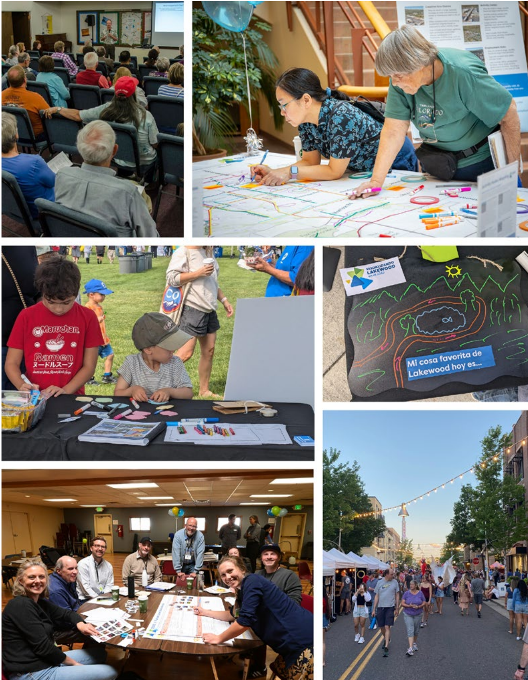
A photo collage showing various examples of the Civic Participation guiding principle in action across the city, such as pop-up tabling events, open houses, advisory group meetings, and community workshops.