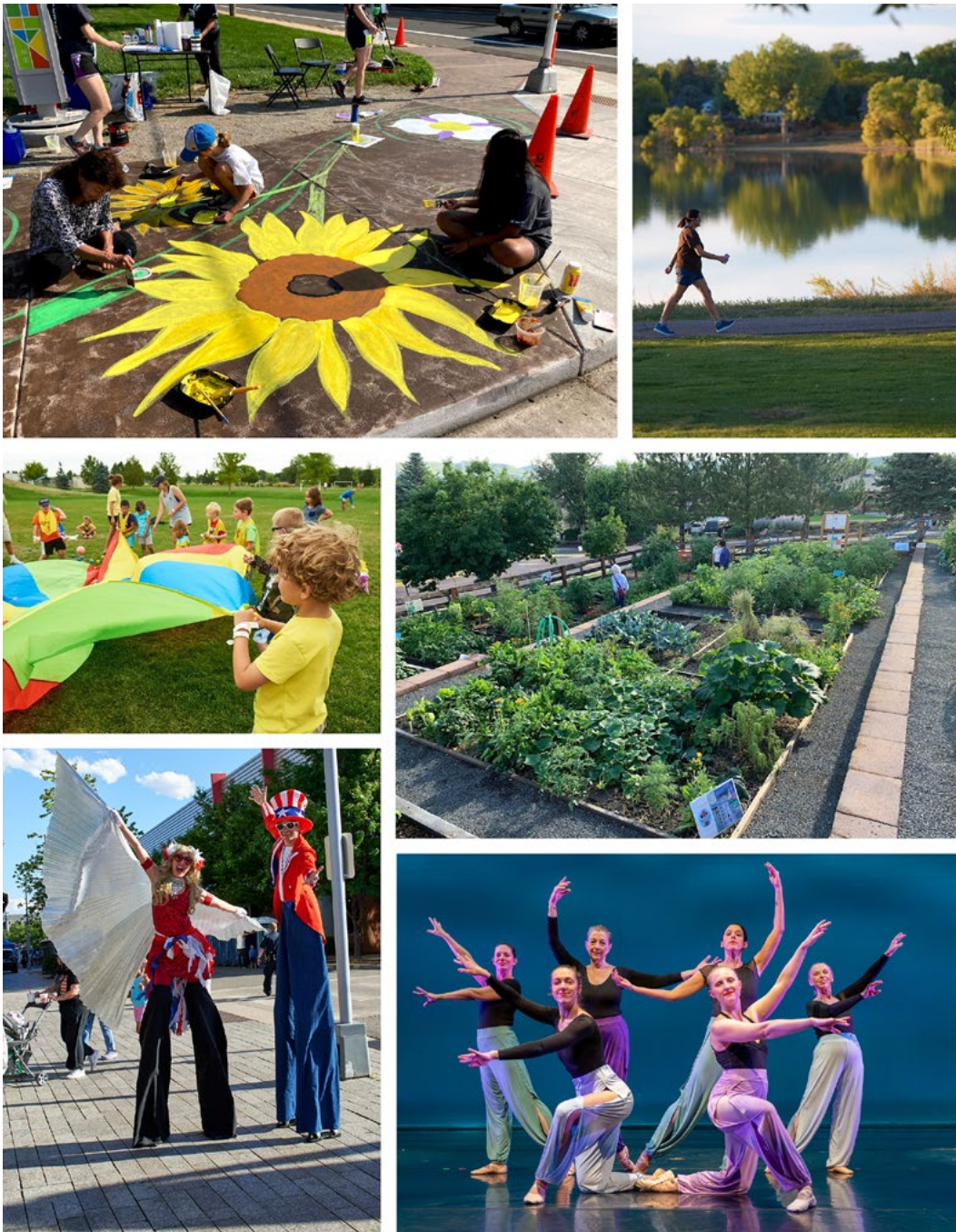
A photo collage showing various examples of the Community Wellness and Vitality guiding principle in action across the city through public art, parks, community events, recreation, community gardens, and more.