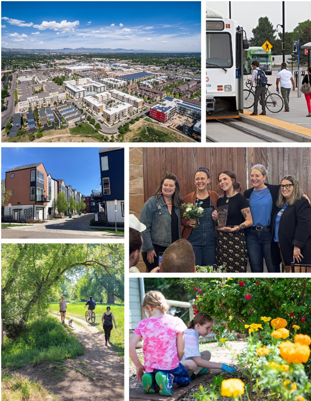
A photo collage showing various examples of the Opportunity and Mobility guiding principle in action across the city through housing options, transportation access, education, healthy living, and economic opportunities.