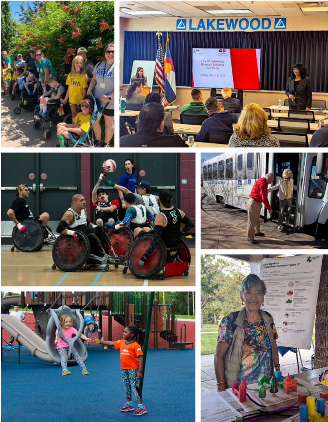
A photo collage showing various examples of the Equity guiding principle in action across the city, such as the PossAbilities Expo, Camp Paha, accessible playground design, Lakewood Rides, Spanish-focused engagement, and more.