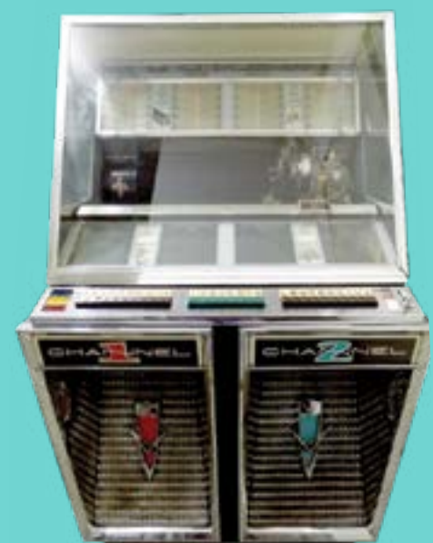
Juke Box (circa 1960)