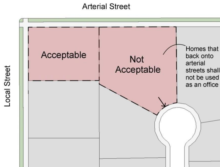
Figure 17.4.2: Restrictions for single-family dwellings being used as an office