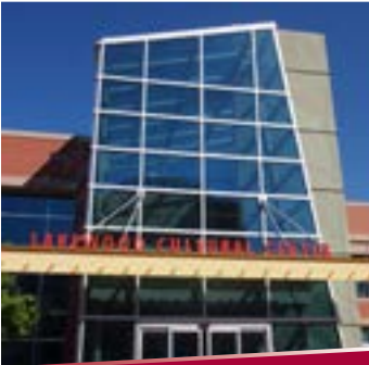
LAKEWOOD CULTURAL CENTER Theater | Exhibits | Classes