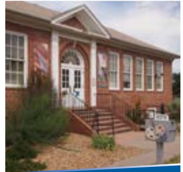
WASHINGTON HEIGHTS ARTS CENTER Classes | Exhibits

Lakewood.org/HeritageCenter 10 a.m.-4 p.m., Tuesday-Saturday Guided tours: 11 a.m. & 2 p.m. No reservation needed for groups of 10 or fewer. 20th Century Emporium: 10 a.m.- 4 p.m., Tuesday-Saturday Inside the visitor center 303.987.7848