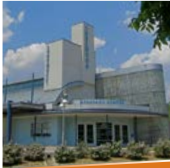
LAKEWOOD HERITAGE CENTER Museum Tours | Store | Exhibits | Classes

Lakewood.org/CulturalCenter 8 a.m.-5 p.m., Monday-Friday 10 a.m.-2 p.m., Saturday Open one hour prior to performances