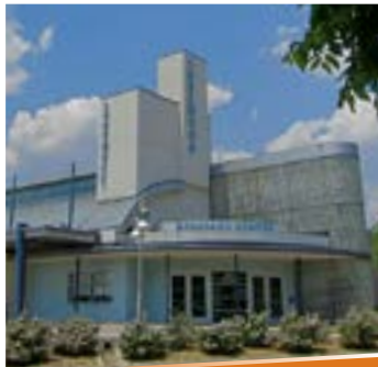
LAKWOOD HERITAGE CENTER Museum Tours | Store | Exhibits | Classes

Lakewood.org/CulturalCenter 8 a.m.-5 p.m., Monday-Friday 10 a.m.-2 p.m., Saturday Open one hour prior to performances 303.987.7845