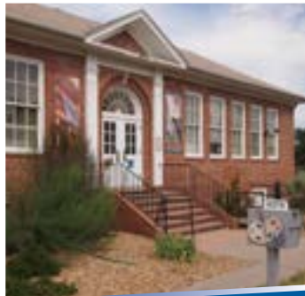
WASHINGTON HEIGHTS ARTS CENTER Classes | Exhibits

Lakewood.org/HeritageCenter 10 a.m.-4 p.m., Tuesday-Saturday Guided tours: 11 a.m. & 2 p.m. No reservation needed for groups of 10 or fewer. 20th Century Emporium: 10 a.m.- 4 p.m., Tuesday-Saturday Inside the visitor center 303.987.7848