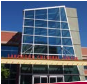
LAKWOOD CULTURAL CENTER Theater | Exhibits | Classes